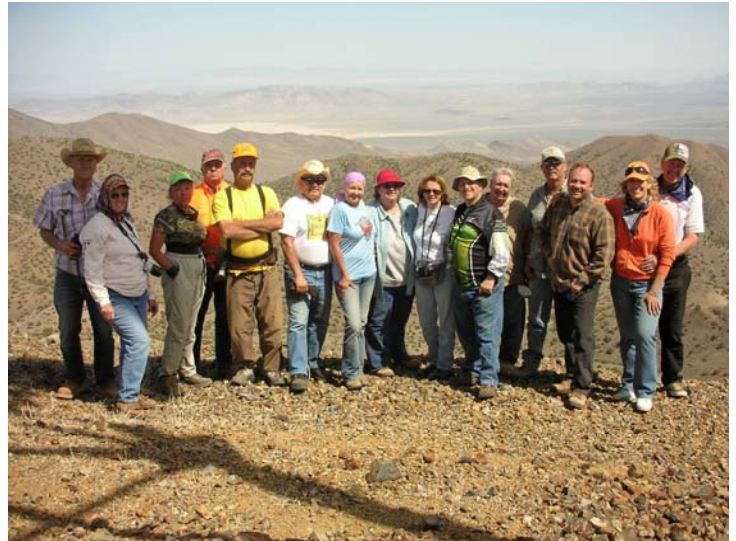
RENNER ATV RIDERS AT THE TOP OF PILOT PEAK