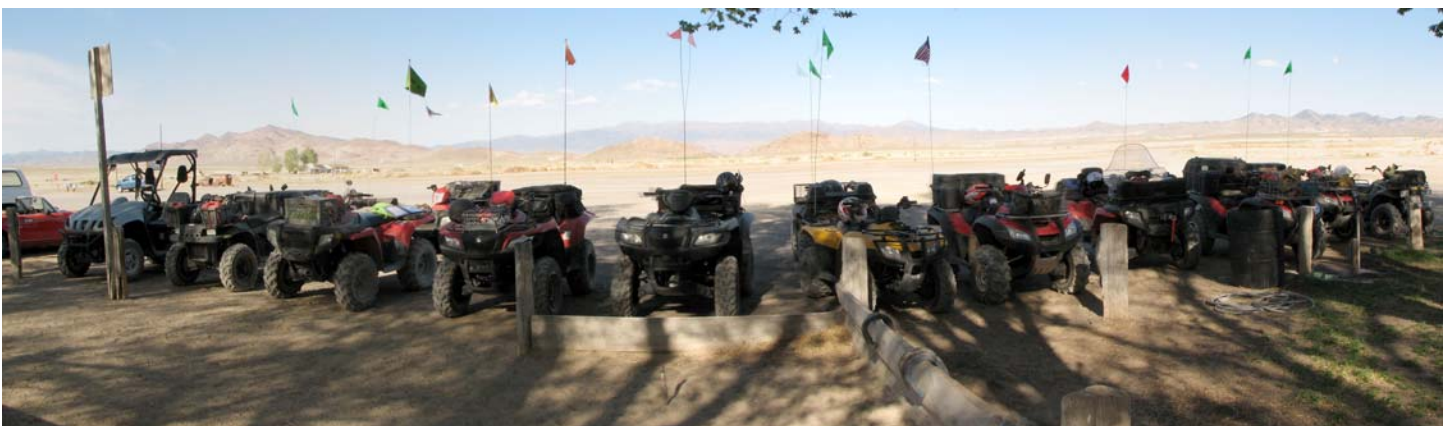
TIME FOR DINNER AT MIDDLEGATE STATION